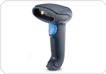
The Unitech MS837 Laser Scanner Installation Instructions and Popular Configuration Settings